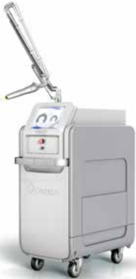
PicoWay® - The Complete PicoSecond Platform

Aesthetic solutions for both the face and body