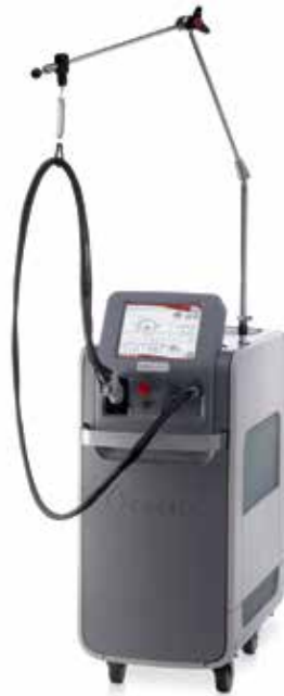
Gentle Pro Series™ — Integrated aesthetic treatment workstation

Shortest picosecond pulses – 40% shorter picosecond pulses mean effective, yet lower energies for less risk of side effects.