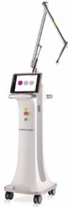
CO 2 RE® — The Complete CO 2 Solution

20, 22 & 24 mm treatment spots are the largest in the market, enabling shorter treatment times and improved patient comfort.