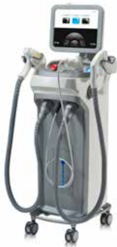
elōs Plus® — Complete aesthetic work station

The ultimate multi-application platform, with 15 different applicators for the most in-demand treatments.