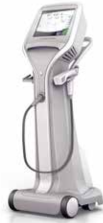
Profound® - 1 st device to create all 3 skin fundamentals

The perfect complement to any aesthetic practice.