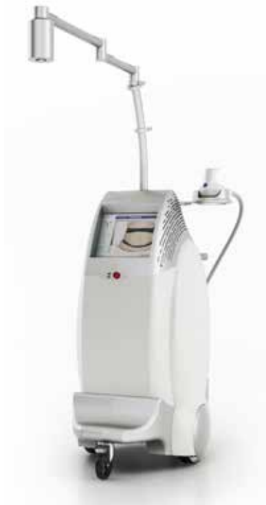
UltraShape Body shaping via fat cell destruction

Intuitive user interface with easy-to-use guided treatment modes.