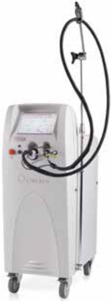
Vbeam® — Best-in-class pulsed dye laser

The gold standard in vascular treatments.