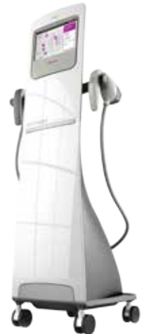
VelaShape III with Guided Mode- The art of body contouring

No bruising, swelling or downtime Higher profitability than any other non-invasive fat-reducing device.