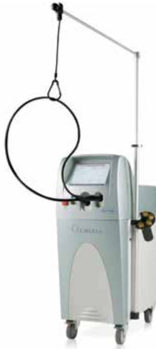
Alex TriVantage® — Pigmented lesion & tattoo removal treatments

Expanding aesthetic applications - reduces bruising associated with injectables and other cosmetic procedures.